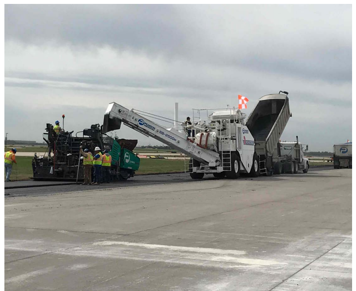
Eisenhower Runway Rehab