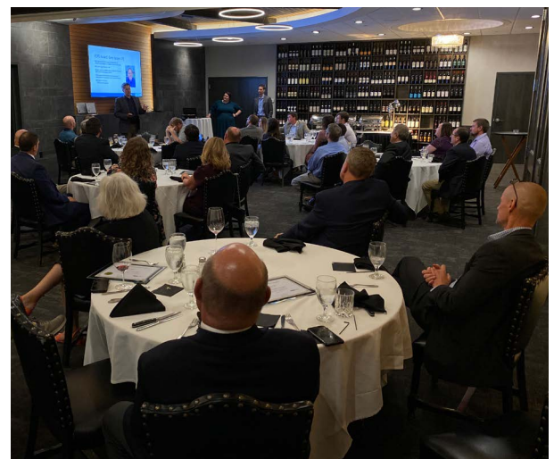
September 23rd, 2021 – WSPE Awards Banquet