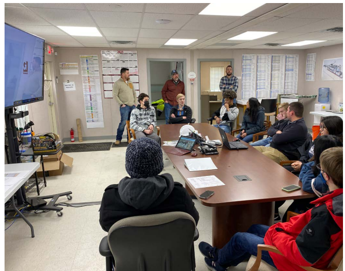
February 24, 2022 – Wichita Northwest Water Facility