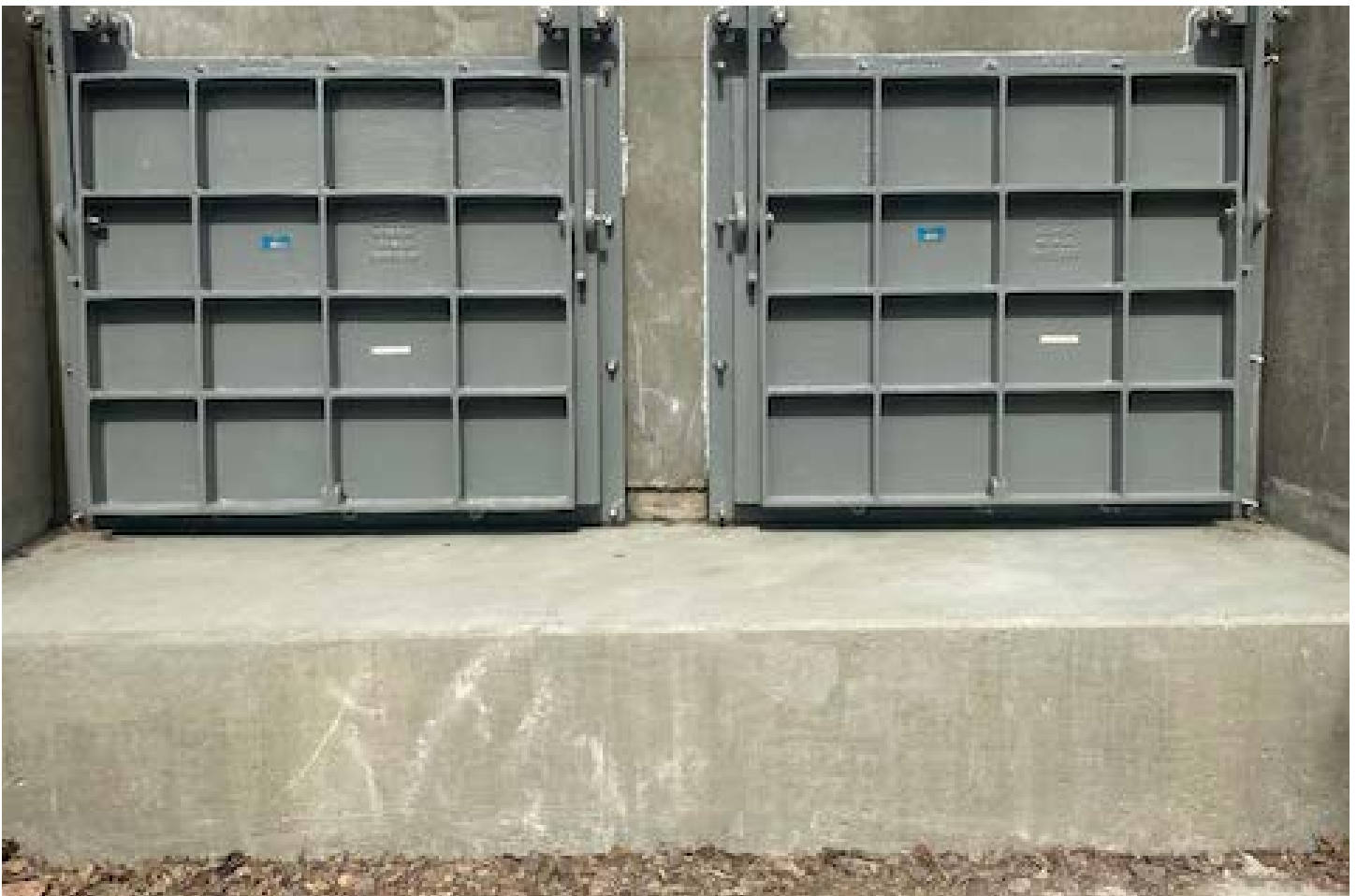
Country View Flap Gate Project – Derby, KS