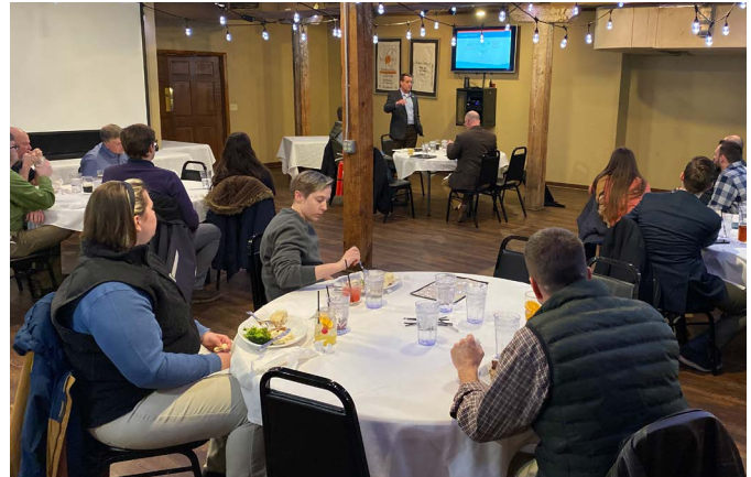
February 24, 2022 – River City Brewery