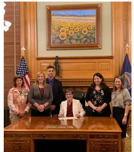
Photos have been collected from the internet. No copyright infringement is intended.

If you are having problems with the e-newsletter or know someone that isn't receiving it, feel free to contact me.