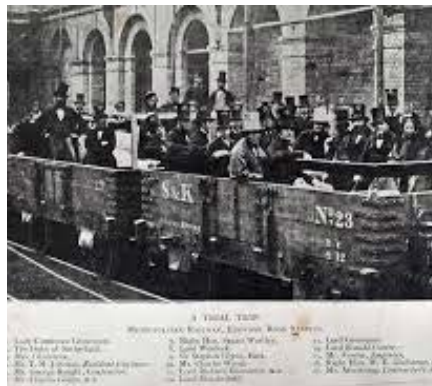
1863, Jan. 10 Metropolitan Railway, London, first underground passenger railway to the public. The train consisted of wooden carriages and steam locomotives. The steam locomotives carried on to 1961 when the line was electrified.

January 10, 1863 – London opened the first underground passenger railway to the public. The Metropolitan, also known as the Met, is a 41.4 mile long underground line that can reach speeds up to 60 mph. When the Met was first created the train consisted of wooden carriages and steam locomotives. The steam locomotives carried on to 1961 when the line was electrified.