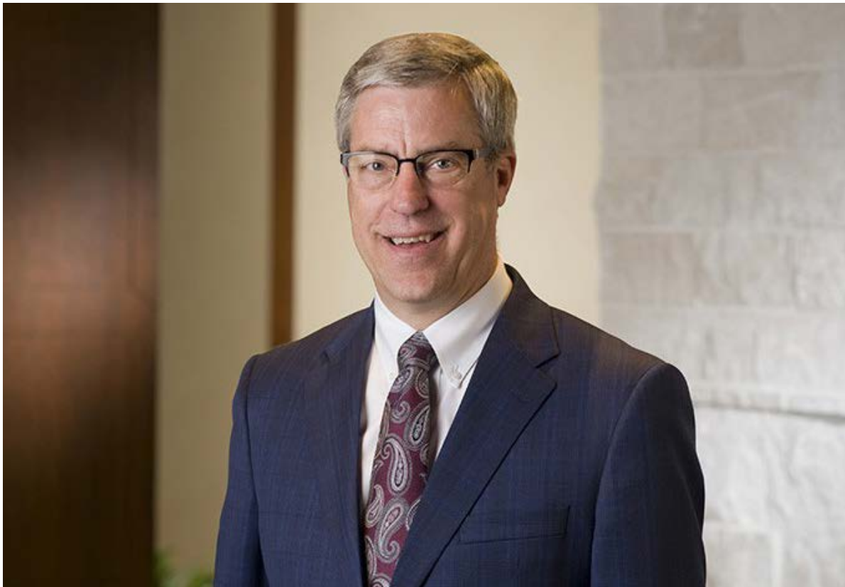
December 16, 2021 – Virtual Presentation