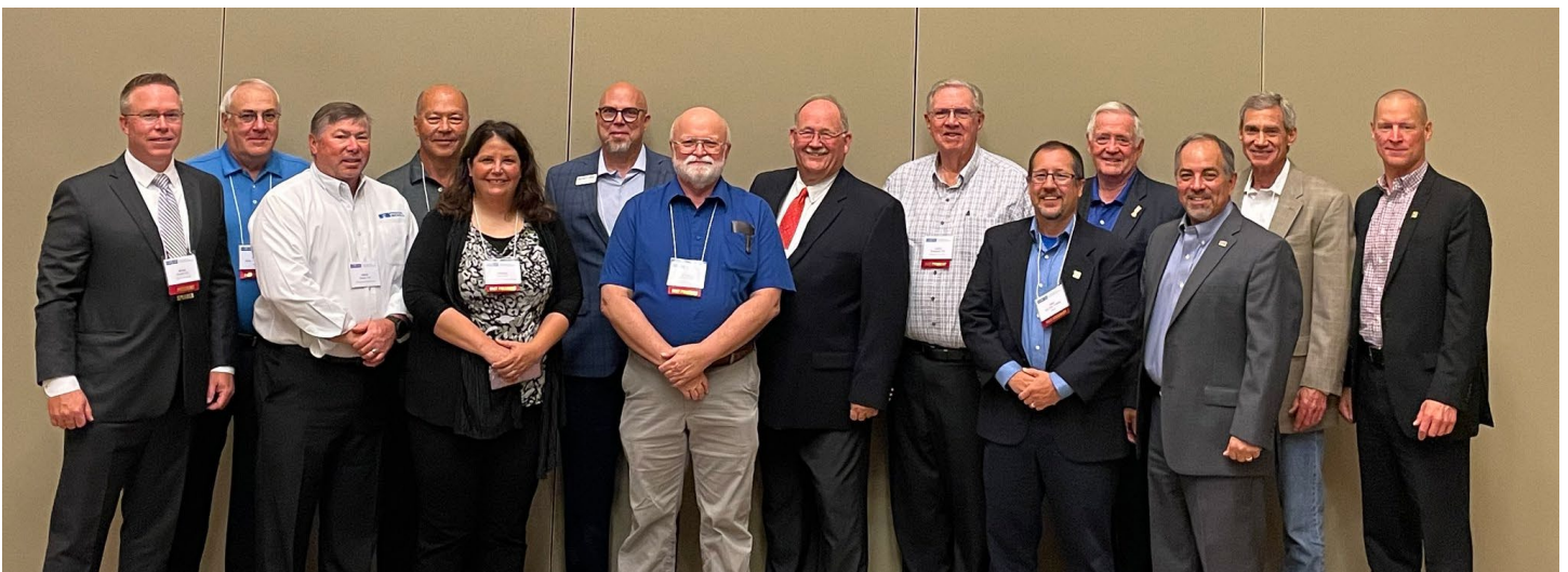
KSPE 2021 Annual Conference – Manhattan, KS