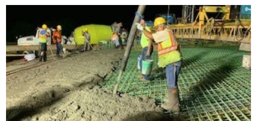
KDOT Green Project