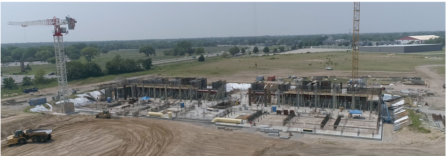
Wichita Northwest Water Treatment Facility