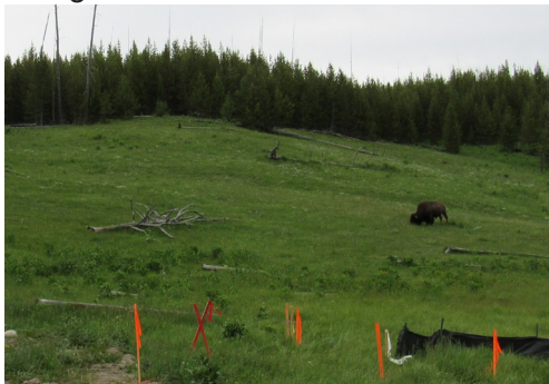
Local wildlife keeps an eye on this construction project in Yellowstone National Park.

W elcome fall! Although the calendar won't call it that yet, the air has been so mild, school has started, and everybody's favorite football teams have been practicing for weeks. I hope everyone had a chance to take some time off over the summer and enjoy the company of friends and relatives. My family got to take an epic road trip that got us to 22 National Parks and Monuments. If you're ever in Yellowstone and want to see the thermal features in a unique way I fully recommend kayaking Lake Yellowstone. We paddled over fish cones, caves, and rising bubbles.