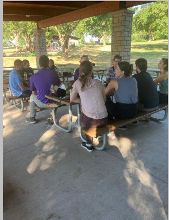
July KSPE/MSPE Young Engineer's Summer Picnic